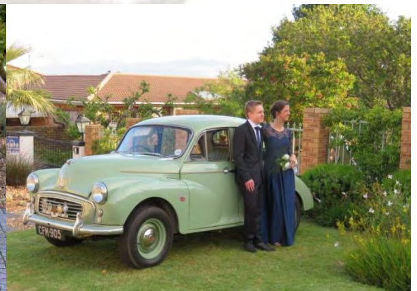
The editor disguised as a chauffeur